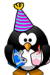
Go to a party

Can you explain why you have sorted them into before and after school?