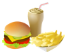
Going out to eat