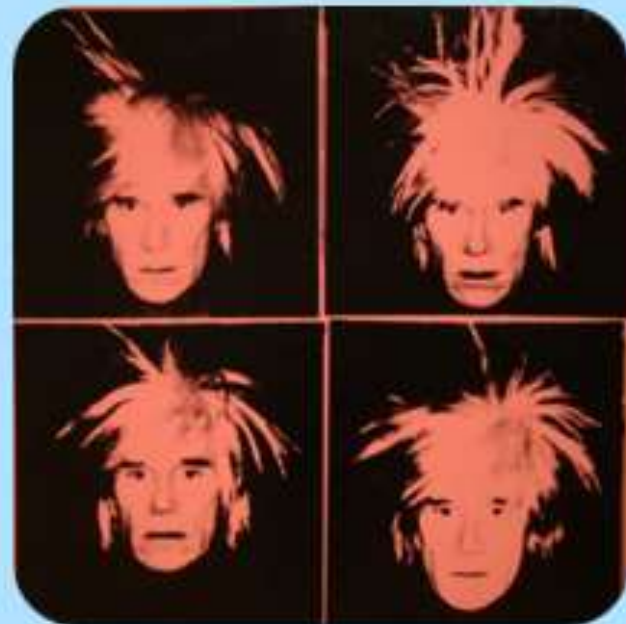
Andy Warhol used photography and screen printing.