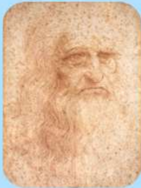
Leonardo da Vinci used chalk on paper.

A self-portrait is when an artist makes a picture of himself or herself.