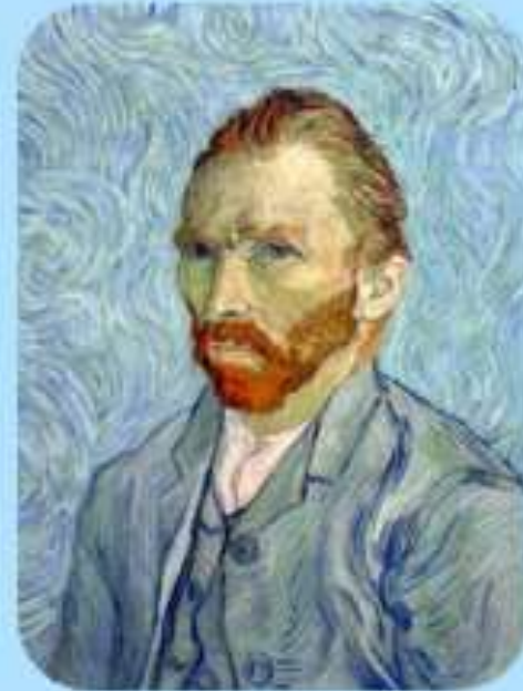
Vincent Van Gogh used paint and swirling brush strokes.